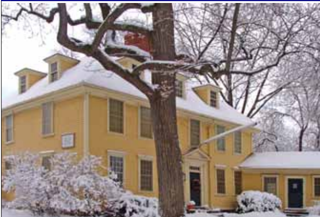
Photograph courtesy of the Lexington Historical Society - Buckman Tavern.

Please share this catalog with a friend!