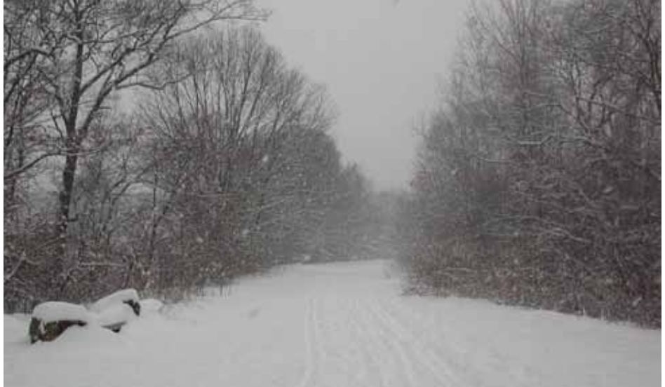
Minuteman Bikepath, behind the Waldorf School.